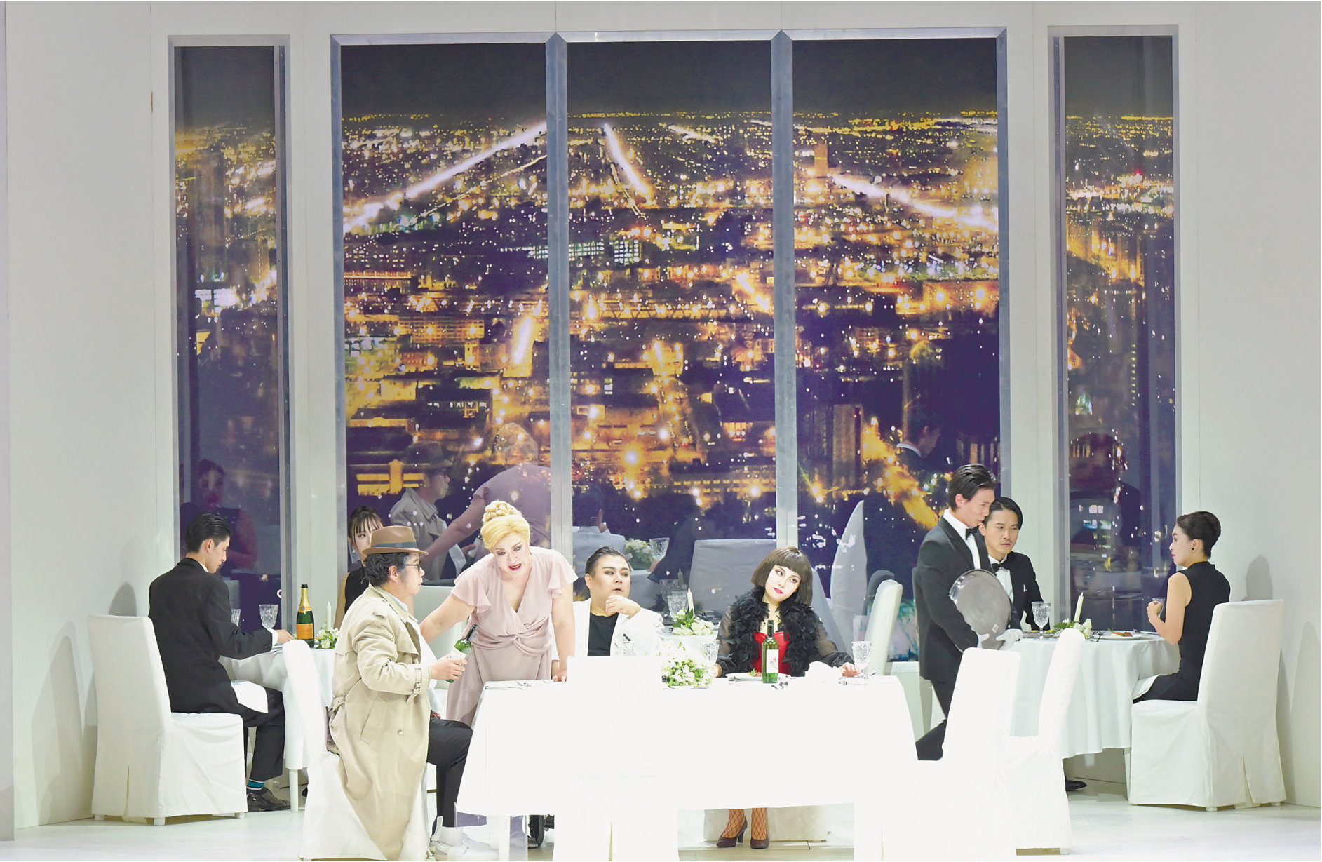
The Tokyo Nikikai Opera Theatre performs a scene from “Die Frau ohne Schatten” in Tokyo against a backdrop of the city’s skyline in October 2024.

Working to grow audiences through international coproductions, expanding regional performances