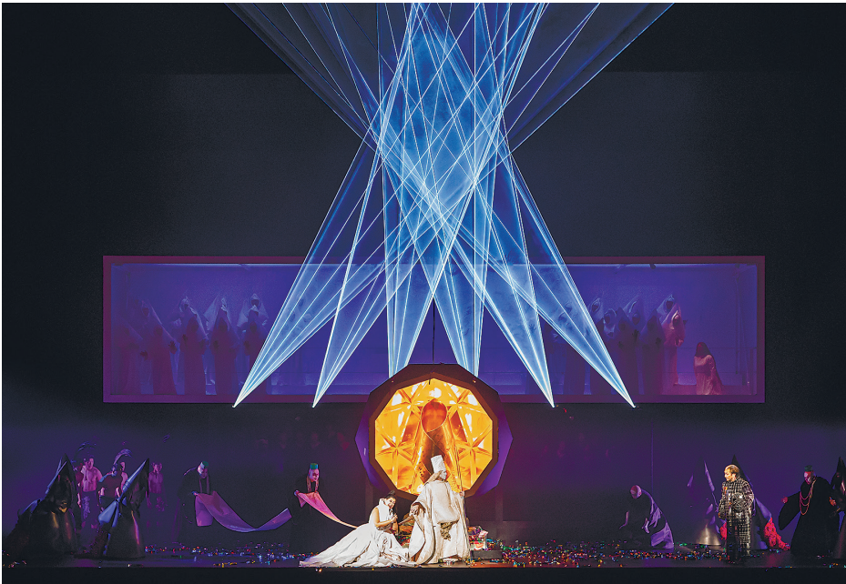
The Tokyo Nikikai Opera Theatre and teamLab collaborate on a performance of Giacomo Puccini’s “Turandot.” TEAMLAB / DANIEL KRAMER / TOKYO NIKIKAI OPERA FOUNDATION