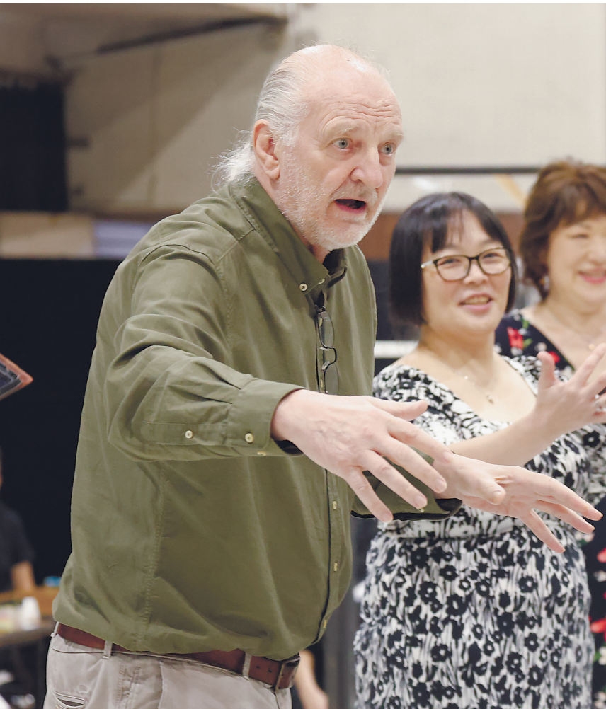
Renowned Director Peter Konwitschny issues directions for staging an international coproduction of “Die Frau ohne Schatten.”