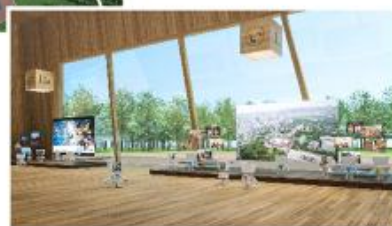
Wood Art Theatre