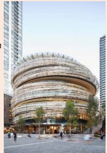
The Exchange (Australia) 2019

Kuma Kengo masterfully combines the cultural characteristics of various Japanese ages and regions in his architecture. From the standpoint that learning about the works of Kuma provide a greater insight into Japanese aesthetics and culture, this exhibition presents a vision for cities in the post-Covid era, making ample use of cutting-edge audiovisual technology such as 360-degree VR and projection mapping to leave behind a legacy in a country where architectural exhibitions are typically comprised mainly of replicas and photographs.