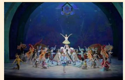
RYUUGUU, Act 1

The revival of the highly acclaimed a new ballet production for 2020. Based on a fairy tale from the well-known story of Urashima Taro, this work has elements of classical Japanese theatre throughout. Taro is mesmerised by the delightful sea creatures in the magnificent Palace of Ryuuguu and the mysterious Chamber of Four Seasons where all four seasons can be enjoyed all at once. But what fate awaits Taro when he returns home? This Japanese-themed New National Theatre, Tokyo's ballet fantasy is a must-see for all ballet fans, whether children or adults.