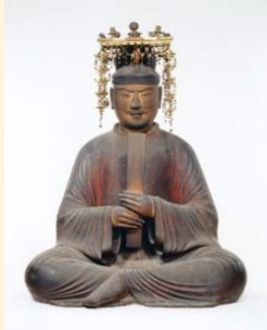
"Prince Shōtoku" from Prince Shōtoku and Attendants, Heian period, 1121 (Hōan 2), Hōryūji Temple, Nara (National Treasure)

Nara National Museum: April 27–June 20, 2021 Tokyo National Museum: July 13–September 5, 2021