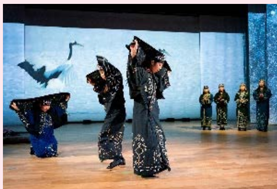
Traditional Ainu dance (crane dance)

Sapporo Cultural Arts Theatre hitaru (Hokkaido): September 18, 2021