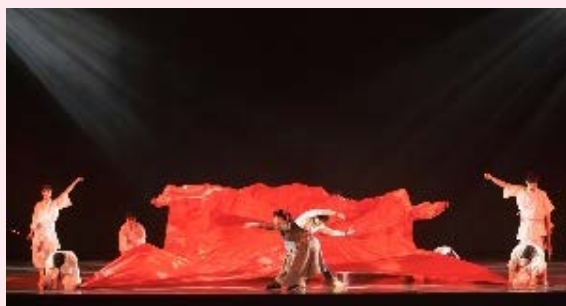
DANCE DRAMA promotion photo

Collaborating between choreographers, professional dancers who are active in Japan and Asia and dancers with disabilities, and implementing the attractive large-scale dance projects based on the nature and traditional culture of Japan establish an international cultural and arts base for people with disabilities with the ability to attract customers and lead to the creation of a symbiotic society.