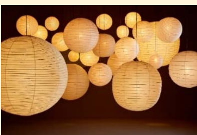
Installation of "Akari" Light Sculptures (reference image)

Tokyo Metropolitan Art Museum: April 24–August 29, 2021