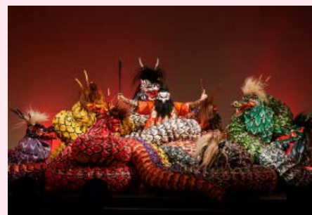
Iwami Kagura (Iwami Welfare Association Performing Club)

A strong sense of compassion for natural colors and sounds continues to permeate the artistic expressions of persons with disabilities and the way they engage with their characteristics in their lives. This nationwide project aims to share with audiences in Japan and around the world the concept of Humanity and Nature in Japan from the perspective of persons with disabilities, expressing Japan’s unique spiritual culture. Launched with Grand Opening held in February 2020, the festival encompasses events across a variety of genres, such as exhibitions and performing arts in seven facilities around Japan. Through partnerships with 500,000 members of organizations for persons with disabilities and welfare workers groups from around Japan in addition to local authorities, the project shares the charms of regional areas with unique cultures.