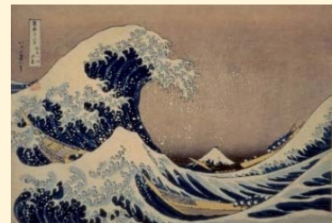
The Great Wave off the Coast of Kanagawa, from the series Thirty-six Views of Mount Fuji, Katsushika Hokusai, 1831–33. Edo–Tokyo Museum

This exhibition will present the entirety of one of Katsushika Hokusai's most celebrated series, 'Thirty-six Views of Mount Fuji', alongside works by his younger rival Utagawa Hiroshige, highlighting how the two artists took up the challenge of depicting sceneries and landscapes, including Mt. Fuji, which has long remained close to and been revered by the people of Japan.