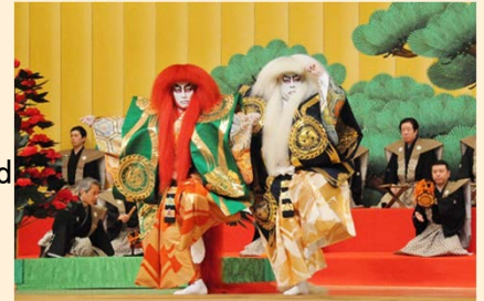
Discover KABUKI image

In addition to the KABUKI, NOH & KYOGEN, and BUNRAKU performances, the 2021 program will be expanded to new fields, with performances such as NIHON-BUYO (Japanese Traditional Dance) and HOGAKU (Japanese Traditional Music). The series of performances includes introduction and multilingual support for overseas visitors, foreign nationals living in Japan, and Japanese beginners.