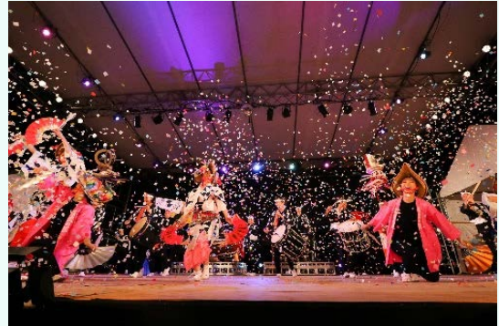
Earth Celebration Committee

Earth Celebration is an annual event that brings together diverse forms of culture in the abundant natural surroundings of an island with the aim of building a new 'earth' culture. Centered around an international outdoor festival with a long history in Japan, this initiative will see entities involved such as Sado Island Galaxy Art Festival and other projects that utilize the island's unique culture to come together to create an international festival across the entire island.