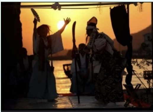
Izumo Kagura: Ōdochi Kagura Hozonkai Kagurakata

Izumo City, Shimane Prefecture: April 2021 – March 2022