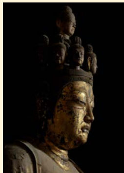
Eleven-Headed Kannon (Detail), Nara period, 8th century, Shōrinji Temple, Nara (National Treasure)

Tokyo National Museum: June 22–September 12, 2021